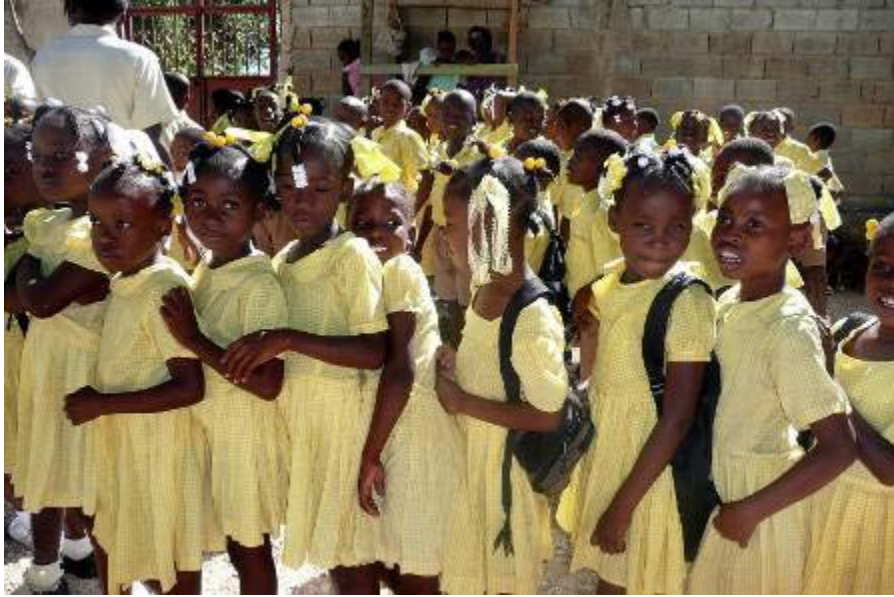
A small proportion of the more than 500 children educated at the Marechal and Heroes of Savannah Schools in 2009.

Looking back, 2009 has been marked by growth, both in terms of the numbers of children educated and in facilities. Twenty-nine children graduated from the Marechal school in 2009. For the 2009-2010 school year, there are 360 students at Marechal and 152 at the Heroes of Savannah School. At last report, the new classroom at Heroes of Savannah is nearing completion, although the work has been slowed by wet weather and bad roads.